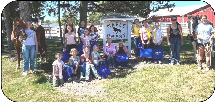
Cowboy/Cowgirl Kids Camp